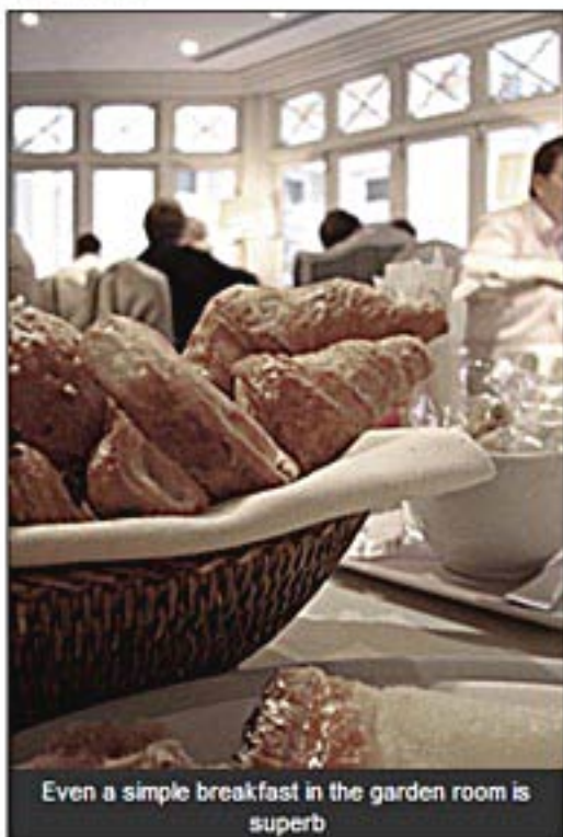
Even a simple breakfast in the garden room is superb

The buffet breakfast at the Castille Paris was a particular treat. The distinction was not so much in the choice of foods which was standard for a European first-class buffet, but the quality of the food, which was so refined that I had to have something of everything. I took it in stages. First the "salty" dishes: eggs, sausage, cheese, prosciutto, capers and cornichons. then fruit and yogurt. I particularly enjoyed the prunes, which still had something of the plum in the taste. Finally the pastries, which I normally don't eat at breakfast, but found irresistible after trying a bit the first morning. The apple tart had a simple crust and slightly-caramelized apples on a single crust that tasted like every dream of apple pie. The pear tart had a bit of almond floating up under the ephemeral taste of pear. And the superb pineapple coconut custard tart with a crust that was more like a cookie.