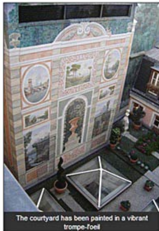
The courtyard has been painted in a vibrant trompe-foeil

Castille Paris 33-37 rue Cambon 75001 Paris France Phone +33 (0)1.44.58.44.58 Fax +33 (0)1.44.58.44.00 email hotel website