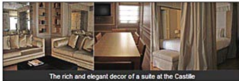
The rich and elegant decor of a suite at the Castille

Each item in the room was exquisite: the modern glass lamp, the velvet chair, the leather stool. Details show an intelligence of design that does not constrain your use of the room. For example, the long dressing table that holds the television has an inset writing desk. You open up the leather lid, sit on the fine leather stool and write a letter. Or keep the lid closed and work at your laptop using the American plug tucked away behind a sliding panel. When you are not using it, the stool tucks completely under the table and so takes up no precious floor space.