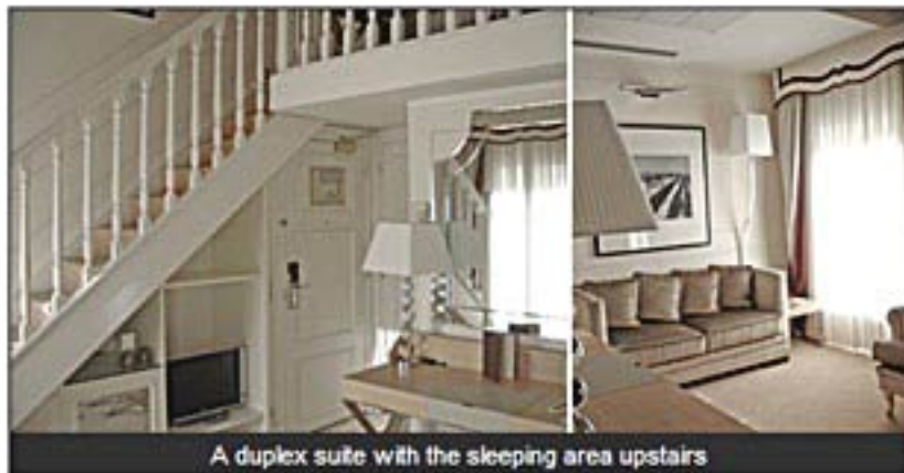
A duplex suite with the sleeping area upstairs

The floor-to-ceiling French windows opened onto a small balcony where I had a view over the rooftops of the Place Vendome. And if I turned to the right, I could see the Tuileries gardens at the end of the street.