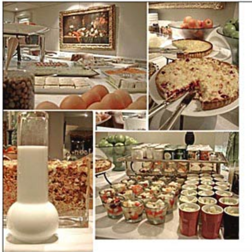
The breakfast buffet

The Castille Paris served hands down the best coffee of my trip. Perhaps because it is an Italian-owned hotel and Italy does have the best European coffee. For whatever reason, I indulged not only in the brew, but in the pastries that go so well with it.