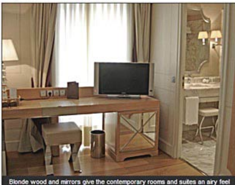
Blonde wood and mirrors give the contemporary rooms and suites an airy feel

The hotel is divided into two separate wings, Opera and Rivoli, each with a different style and feel, though both offer peace and quiet thanks to extensive soundproofing and a lot of light, giving the rooms an airy and peaceful feeling. The Opera wing has 88 rooms in two different styles of decor. The Rivoli wing has 20 rooms in a French classic style.