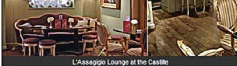
L'Assaggio Lounge at the Castille

Budget Hotels in Paris 280 Hotels and B&B's in Paris. All hotels with guest reviews. www.budget-hotels.in/paris