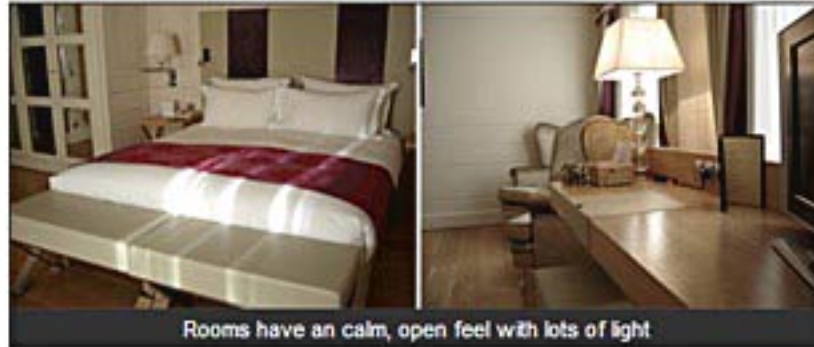
Rooms have an calm, open feel with lots of light

The Venetian style rooms invoke the feel of baroque Italy. The Rivoli style rooms are in black-and-white for a very French "Chanel" look. There is a great deal of light in the rooms, and the walls are painted a pale eggshell white with trompe-l'oeil wainscoting artfully done.