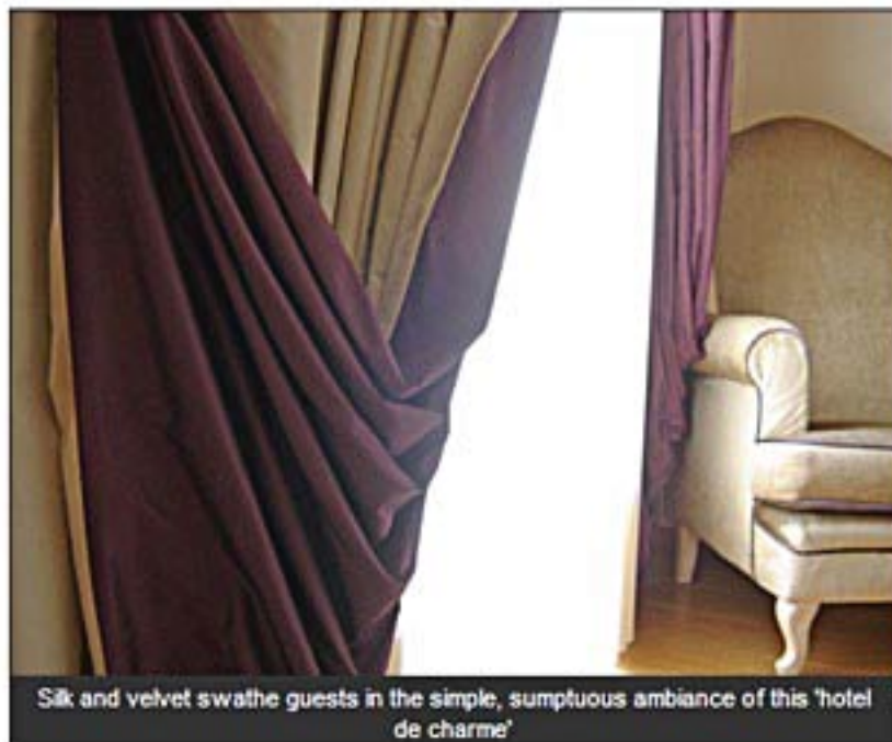
Silk and velvet swathe guests in the simple, sumptuous ambiance of this 'hotel de charme'

The Starhotels Castille Paris hotel wraps you in its elegant embrace the moment you pass through its doors on the rue Cambon in the 1st arrondissement of Paris. The lobby, the staff, the rooms and the ambiance combine in a perfect blend of refinement and hospitality. I loved staying there for the location, the food, the comfort and the personal touches that make the Castille Paris a hotel like no other.