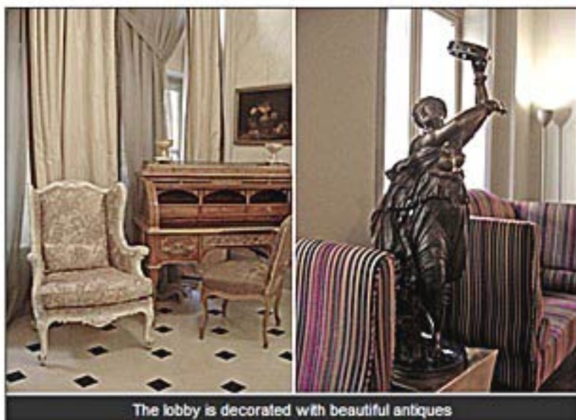
The lobby is decorated with beautiful antiques

The lobby of the Castille Paris is furnished with a combination of fine antiques with rich upholstery, beautiful cushions and exquisite drapery. The effect is both elegant and inviting. The lobby colors are in a classical French-European colors - olive green, bordeaux red that borders on purple and a bright peach. The colors play out in a range of sumptuous fabrics that bring texture and depth to the space, the way classical oil paintings have a layered magnificence. In fact, the decor resonates perfectly with the many fine 18th and 19th Century paintings on the walls as if the world lived in the hotel is a direct descendent from the world portrayed on the canvas. Perhaps this feeling comes in part because the Castille Paris was originally an 18th Century residence and has managed to retain its air of once-upon-a-time.