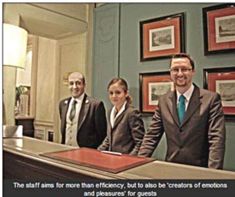
The staff aims for more than efficiency, but to also be 'creators of emotions and pleasures' for guests

Paris is a big city and is divided into large sections called arrondissements. Each arrondissement has its own flavor and style ranging from sedate to bohemian, from high fashion to artsy. The First Arrondissement is at the very center of Paris and is the most elegant, refined, and has the greatest concentration of historic attractions. If you stay in the First, you can easily walk to almost every sight and shop your heart desires to visit. When staying at the Castille Paris , you can enjoy almost every sight and activity that Paris is known for without ever getting on a subway or in a taxi.