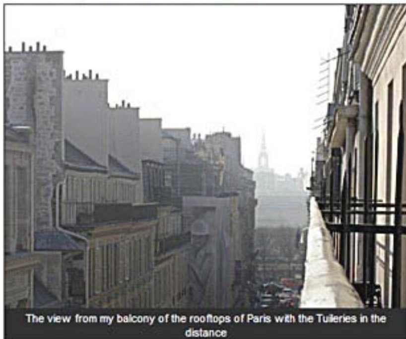
The view from my balcony of the rooftops of Paris with the Tuileries in the distance

The floor-to-ceiling French windows opened onto a small balcony where I had a view over the rooftops of the Place Vendome. And if I turned to the right, I could see the Tuileries gardens at the end of the street.