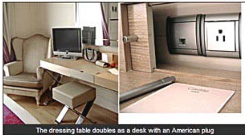
The dressing table doubles as a desk with an American plug

I stayed in a contemporary room in the Opera wing and found it serene and comfortable. The floors and woodwork are a light, blonde tone, giving the room a clean, fresh feeling and an impression of space. The rooms in the Castille Paris , as in all of Paris, are smaller than most Americans expect. This is something you need to be prepared for if you want to stay in the center of Paris. But then, staying in the heart of Paris, you don't have to hang out in your room when there are cafes aplenty just up the street or around the corner.