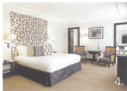
4. Castille Paris, France

Paris is undoubtedly the capital of European chic, so if you are lucky enough find yourself in this magical city it is only fitting that you should stay in one of its finest hotels. Situated on the Rue Cambon, birthplace of Paris' first Chanel store, Castille sits within the very beating heart of Paris' shopping district. Just a stone's throw from the Jardin des Tuileries and Place Vendôme, the hotel's location is sine qua non but it's its cool, laidback decadence and ultra vogueish interior – encompassing '60s monochrome fashion prints – that make you want to sip Martinis and wander barefoot around your fabulous home from home.