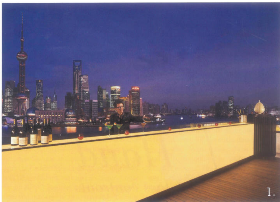
1. The Peninsula, Shanghai, China

With a distinguished heritage as one of Asia's oldest hotel companies, The Peninsula Hotels group has had over a century's experience in a market that the world is now rushing to conquer – benefiting from the knowledge that though times may change, customs and value seldom do. Situated on Shanghai's historic Bund amid former imperial consulates and gleaming new skyscrapers, the hotel fuses age-old traits of impeccable service and the warmest of welcomes with state-of-the-art luxury. Glorious art deco motifs abound throughout while the rooftop bar offers one of the most staggering views of this space age city.