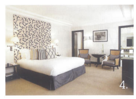
4. Castille Paris, France

Paris is undoubtedly the capital of European chic, so if you are lucky enough find yourself in this magical city it is only fitting that you should stay in one of its finest hotels. Situated on the Rue Cambon, birthplace of Paris' first Chanel store, Castille sits within the very beating heart of Paris' shopping district. Just a stone's throw from the Jardin des Tuileries and Place Vendôme, the hotel's location is sine qua non but it's its cool, laidback decadence and ultra voguish interior – encompassing '60s monochrome fashion prints - that make you want to sip Martinis and wander barefoot around your fabulous home from home.